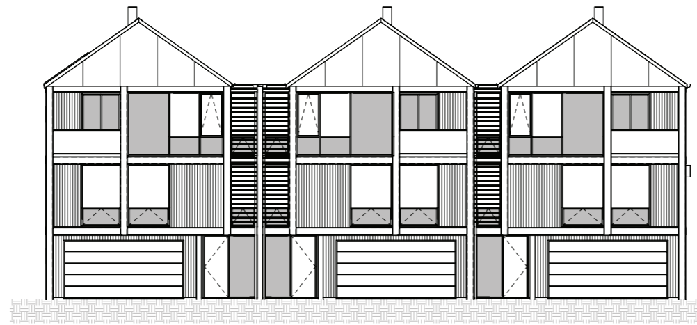
Villa 9 SOLD

*Excerpt only, the full plans have also been provided.